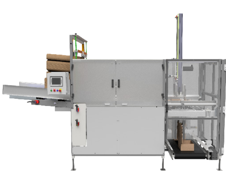
HTF Horizontal Tray Former