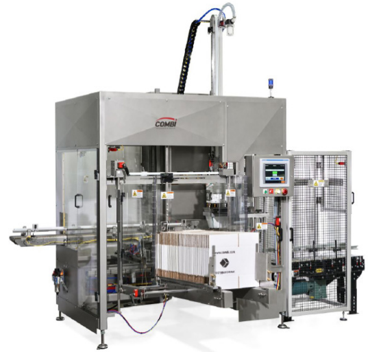
ALPHAPACK® 8/10 Integrated Case Erector