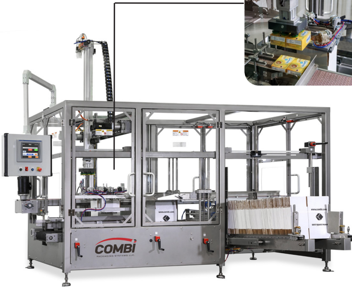
ALPHAPACK® 15/20 Integrated Case Erector and Bottom Sealer