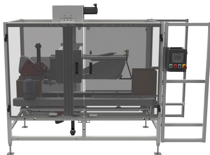
TBS-100RH 12 Random Height Case Sealer